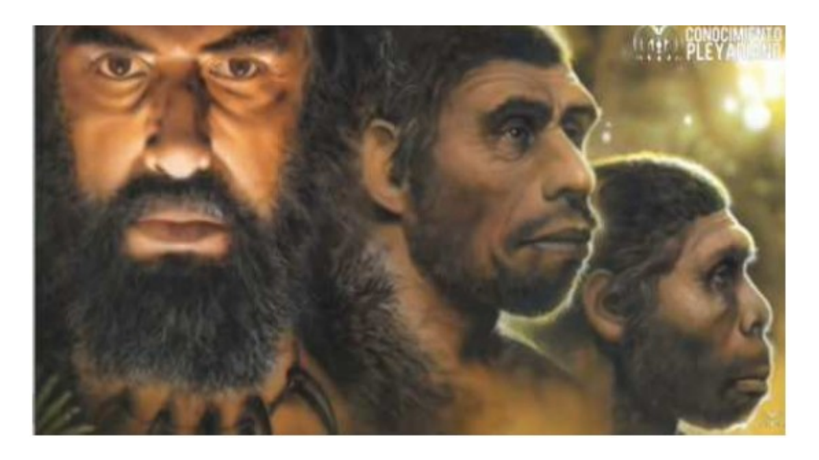
Estel·la.- And, after fleeing, did they also coexist with the other races of Atlantis?

was inhabiting Europe, especially Eastern Asia and Africa. Being that, the most inhabited place of Neanderthals was in the area of Bucegi, Romania, near Turkey. And, the Homo Sapiens movement went straight there. The Neanderthals were not primitive, without a brain as they are depicted, but they were mentally advanced beings, with a lot of connection towards the spiritual and towards nature. Pre-industrial society, yes, but emotionally connected with the Earth and at peace with it and among the other Neanderthal tribes since they had a clear empathic capacity far above the human one.