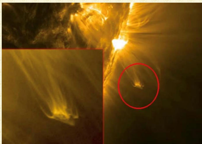
Large classic ship coming out of the solar portal (above)